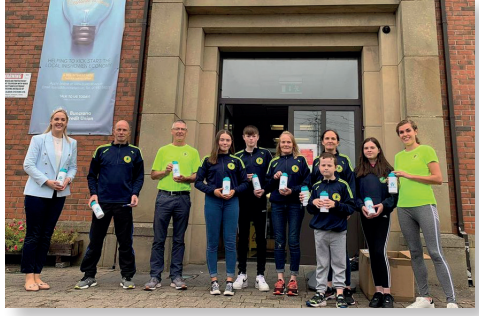
Inishowen Credit Union donated water bottles to Gleneely Colts FC and Inishowen Athletics Club